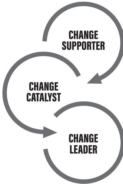
FIGURE 34.2: Change Agility Expert Roles